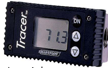
* Connector not shown.

Accurately Measure Flowrates BTUs & Temperatures. No need to guess! Portable LCD Unit